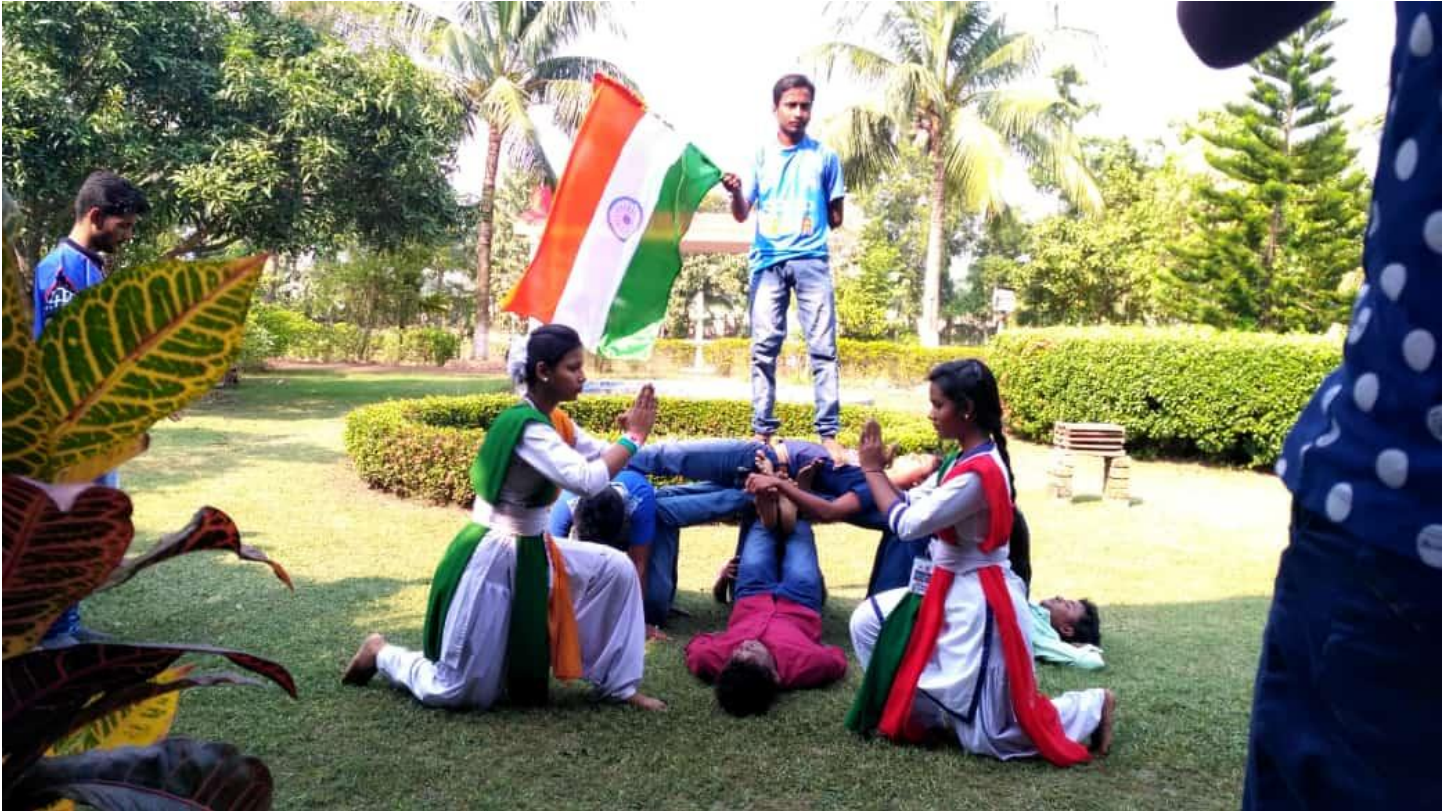
Activities resonating spirit of national integration and social harmony during NSS Special Camp