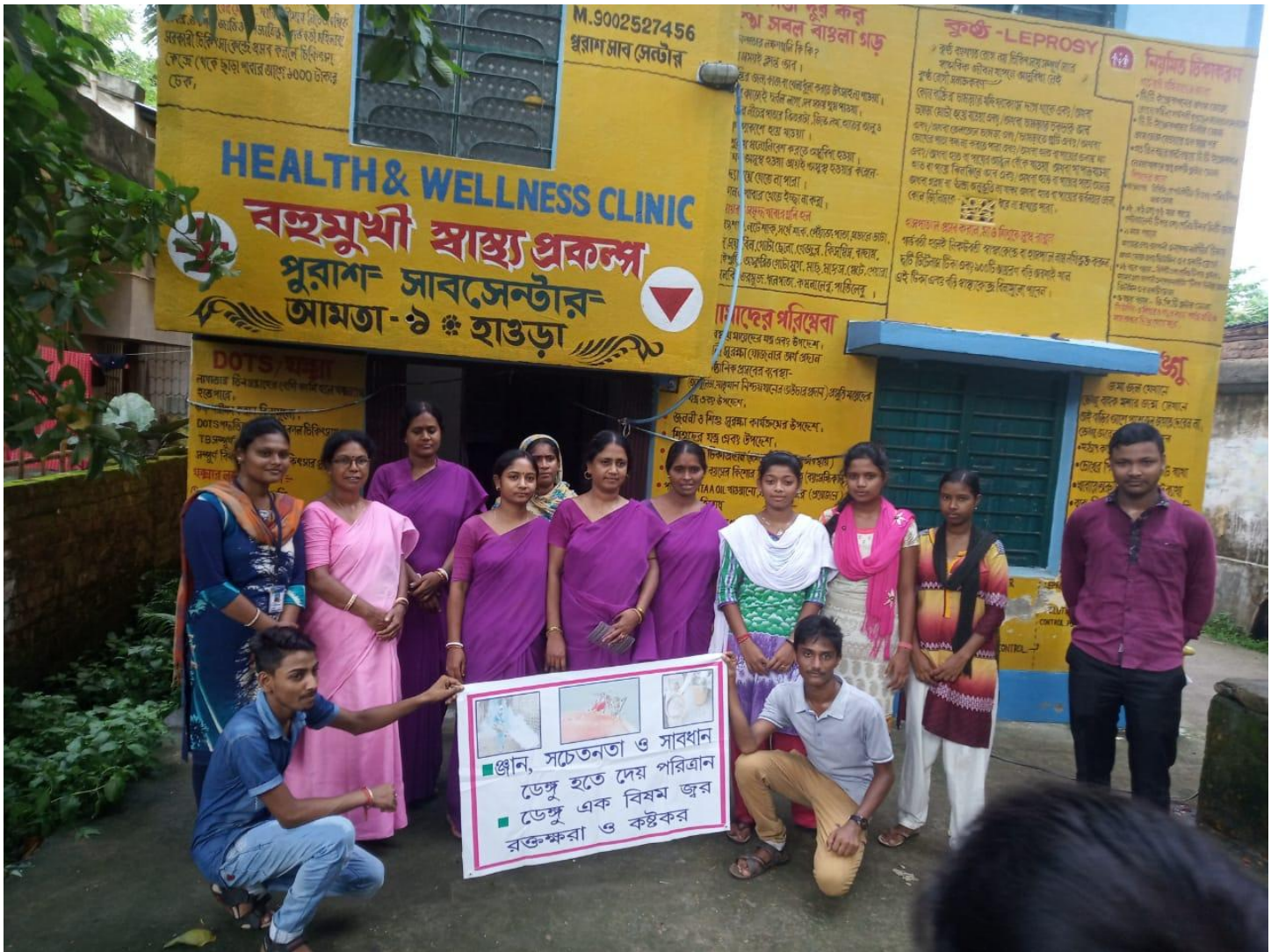
Collaborating with the local Health Centre as part of the Dengue Awareness Rally - developing among themselves a sense of social and civic responsibility