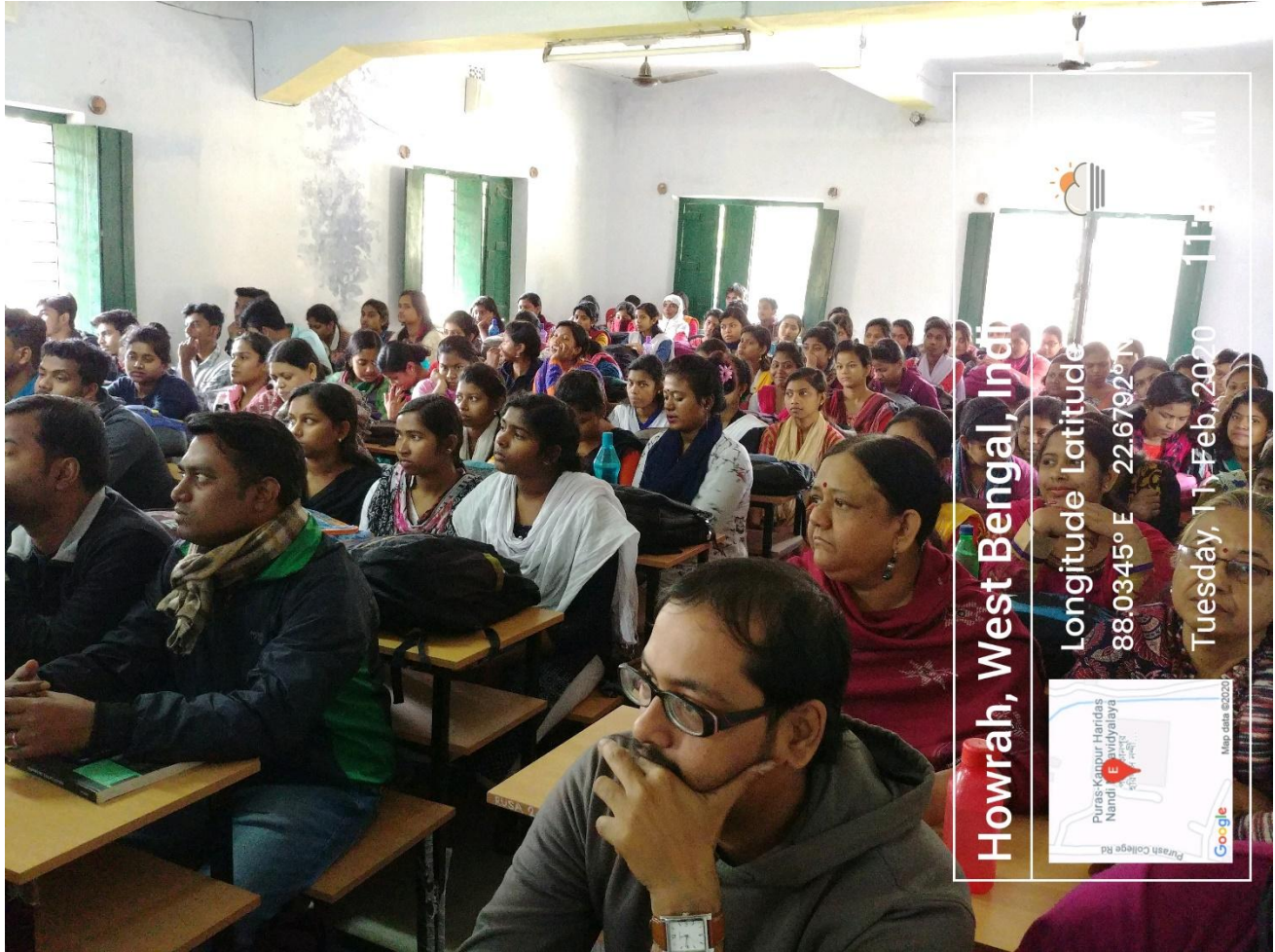
Overwhelming response from the Students and Staff in the programme