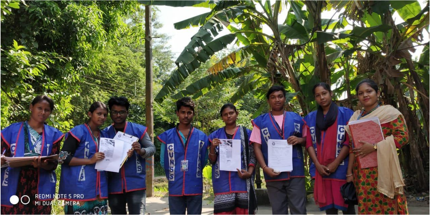
Carrying out door-to-door survey in the adopted villages