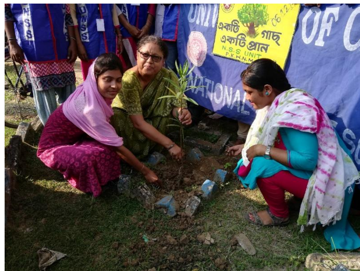
Tree Plantation programme carried out by NSS along with some of the faculty members